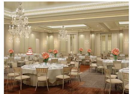
Hotel Entry Presidential Suite Ballroom